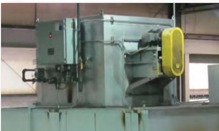
Model BFPL Baking Oven