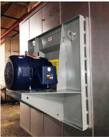
Model BEPL Baking Oven