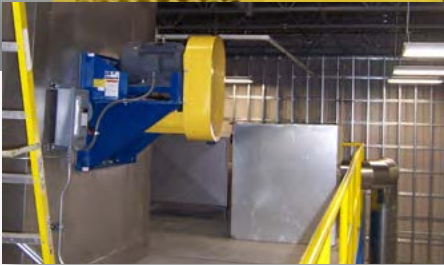
Model BCPL Baking Oven